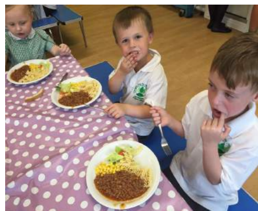
Our new dining experience

We recognise the many benefits of children having good attendance and being punctual and give certificates and rewards to children who excel in this area. We also work closely with the Education Welfare Service to support and promote good attendance and punctuality. The school works closely with professionals such as the school nurse, speech and language therapists, Education Welfare Service and Educational Psychologists. Referrals will be made where necessary and parents will be consulted at each stage.